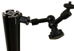
Step 7. Mount is now ready to accept a camera on the standard 1/4-20 camera mounting screw.