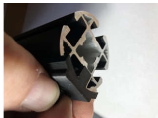
Step 2. Slide the bolt and the mounting plate into the slot on the pole.