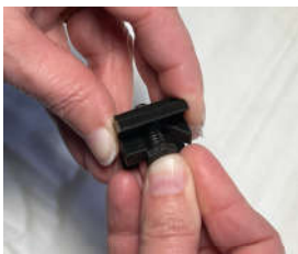
Step 1. Insert the bolt through the mounting plate.